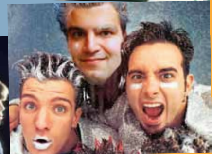
N'Shalah wowed the world with the party anthem, 'Let's Get Behzy'