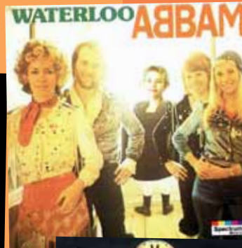
Original member of ABBAM, fame initially eluded Mel when the other members chose a different direction