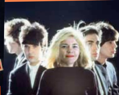
As the original Blondie, it was only when she wanted to rename the band 'Curlie' that they parted ways