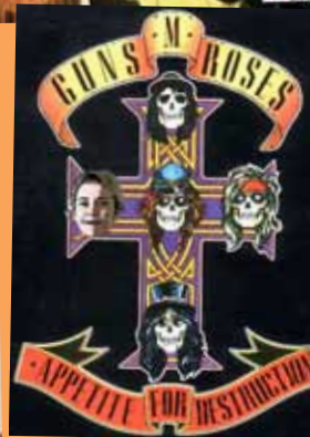
Guns 'M' Roses dropped the M but Axl's vocal style was pure Mel