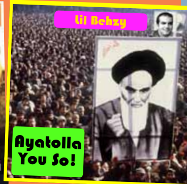
Lil Behzy had hit after hit, charming the world with gems like 'Shah-Tupya-Face'